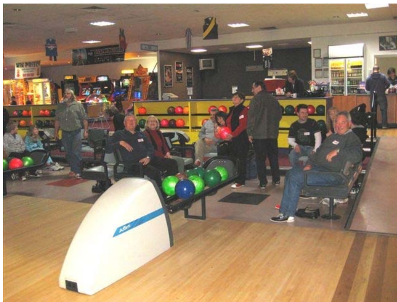
NFG members at Bowls night